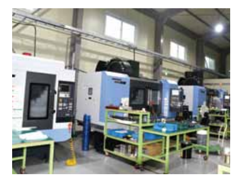
Having started with the Mynx 7500 and 4500, INT now operates more than ten Doosan machine tools.